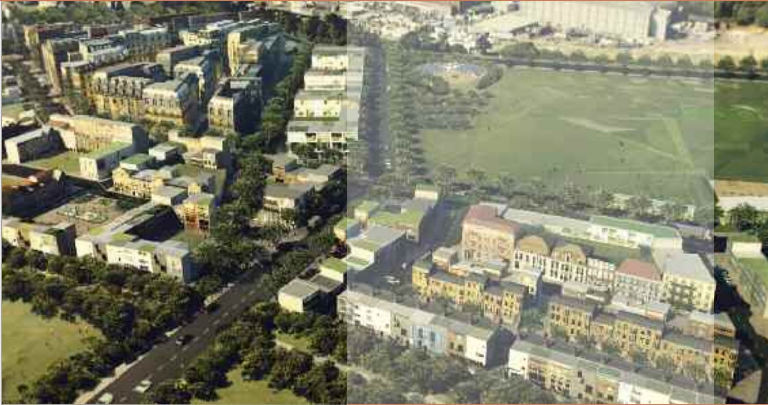
Artist's impression of Project Pinewood and 'The Fields'

The planning applications for Project Pinewood were submitted to South Bucks District Council in June 2009. The Council has consulted with relevant statutory consultees and has received a range of responses to the applications from them and other parties. A determination by the Council's planning committee is scheduled for 21 October.