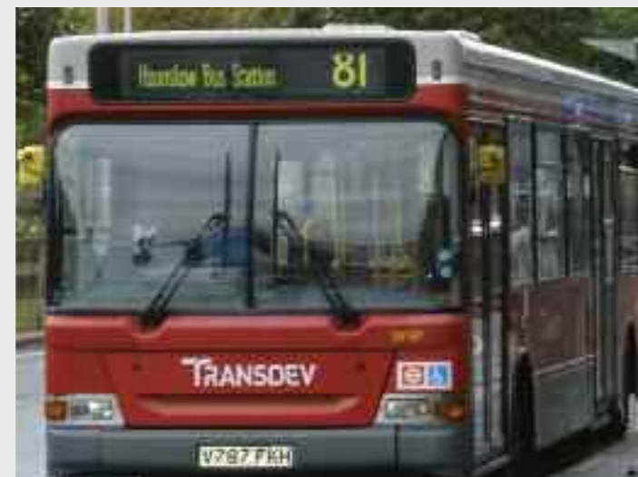
Additional public transport commitments

and neutral grassland. The higher value areas, including The Clump, will remain, as will most of the hedgerow on the site. The biodiversity and nature conservation plans will implement a detailed, supervised ecological management plan that will include enhancement of The Clump woodland and hedgerows, and protect the ecology of the site. The landscaping proposals are extensive and will create natural corridors to Black Park, Iver Heath Fields and beyond. A range of mitigating ecological and landscaping measures are articulated in the planning submissions throughout the implementation of the scheme as well as for the long term benefit of the wider community. Archaeological investigative work was undertaken in response to a request from Bucks County Council.