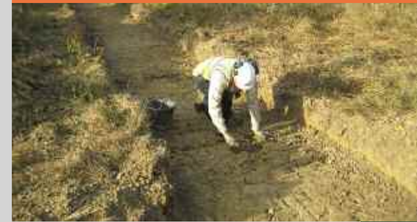
Archaeological survey work being undertaken in September 2009

Whilst the detailed building design for Project Pinewood will be completed at a later stage, the visual impact of the scheme has been assessed and is shown in the relevant planning submission documents to be limited. The assessment has been conducted on the assumption that the Masterplan for Pinewood Studios will be fully implemented. Taller buildings will be constructed away from the sensitive viewpoints and natural buffer zones will be planted, ensuring that the scheme will retain open and accessible characteristics: over 25 hectares of the 46 hectares site will be open, landscaped land for amenity use and will provide habitats for wildlife.